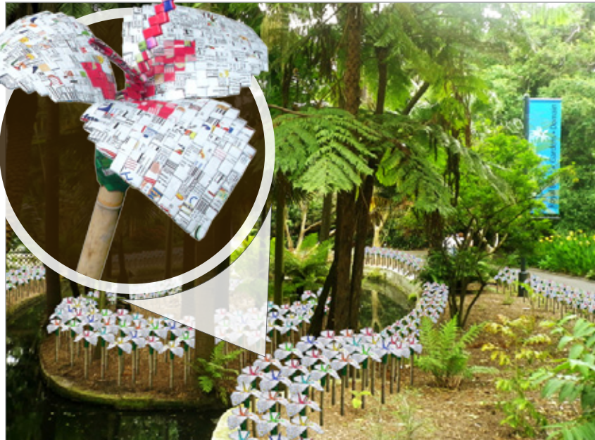
HUNDREDS OF FLOWERS MADE FROM RECYCLED RUBBISH FORM A PUBLIC ART INSTALLATION AT THE ROYAL BOTANIC GARDENS IN SYDNEY